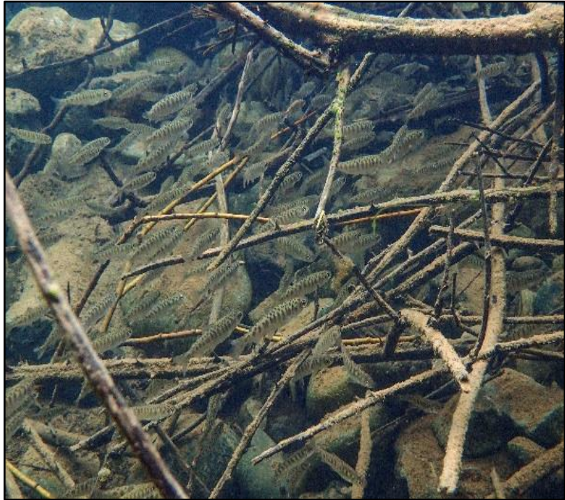
Photo 2. Young salmon on the Trinity River

The TRRP is proposing to change how variable annual instream flows are managed (Primary TRRP Component #1) with existing ROD water from Lewiston Dam. Since the implementation of the ROD, variable flow releases (aka restoration releases) have occurred after the water year type is determined in mid-April 3 . An approved hydrograph (i.e. water release schedule) developed by TRRP determines how much water is released daily during this period of elevated flows. Variable releases typically extend to early summer before returning to baseflow conditions and then remain at baseflow until the following April when a new water year is determined.