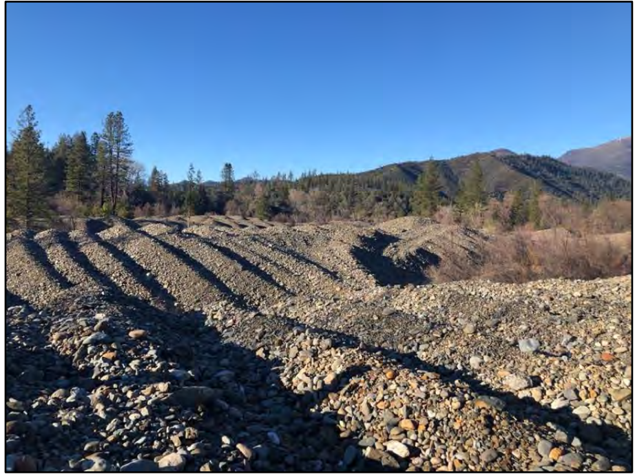
Mining waste (tailings) at the proposed Oregon Gulch project area

To achieve the goals and objectives of the Oregon Gulch project, TRRP proposes the following project activities: