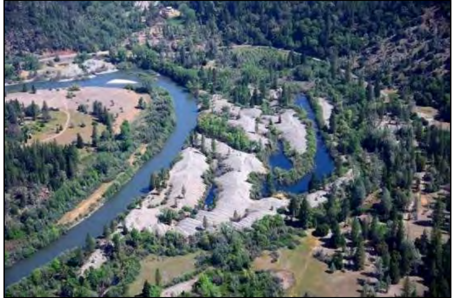
Oregon Gulch project area

The U.S. Department of Interior (DOI) established the TRRP in 2000 with the goal of restoring the fisheries of the Trinity River affected by dam construction and related water diversions of the Trinity River Division of the Central Valley Project 1 . Baseline ecological conditions of the Trinity River at the