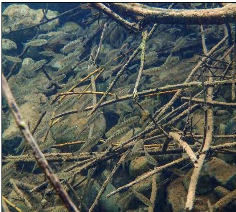
Rearing habitat for young salmon and steelhead after TRRP project construction

As part of its continuing Trinity River restoration efforts, the TRRP proposes to construct the Oregon Gulch Channel Rehabilitation Project near Junction City, California. The TRRP will complete an Environmental Assessment/Initial Study (EA/IS) to meet the requirements of the National Environmental Policy Act (NEPA) and the California Environmental Quality Act (CEQA). The NEPA effort will be led by Reclamation and the BLM Redding Field Office, and the CEQA effort will be led by the North Coast Regional Water Quality Control Board. The EA/IS will evaluate and disclose the potential environmental effects of implementing the Oregon Gulch project. Reasonable alternatives that could satisfy the intent of the proposal will be analyzed if they are determined to be feasible. At minimum, the EA/IS will analyze the effects of the Proposed Action (the Oregon Gulch project) and a No Action Alternative.